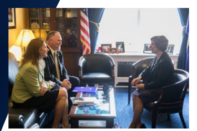
Rep. Suzanne Bonamici (D-OR

Nearly four hundred AHLA and AAHOA members descended on Capitol Hill for the 2018 Legislative Action Summit to share their stories with members of Congress. With more than 230 meetings with Members of Congress and staff, we showed the strength, size and diversity of our industry while highlighting the vast opportunities our industry provides. LAS attendees educated congressional offices on policies that will help grow our industry such as supporting international tourism, and new protections against online booking scams for consumers. LAS attendees also heard presentations by key leaders in Washington including U.S. Department of Labor Secretary Alexander Acosta; Sen. Mike Rounds (R-SD); Reps. Henry Cuellar (D-TX), Rodney Davis (R-IL), Scott Peters (D-CA); and Deputy Assistant Secretary for the National Travel