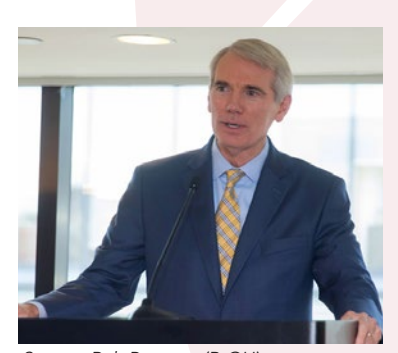
Senator Rob Portman (R-OH)