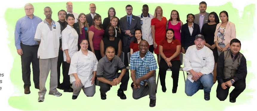
Hotel industry associates visit AHLA headquarters before the White House announcement on apprenticeships.