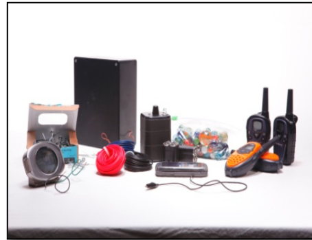
Figure 3: Suspicious Items (DHS)

NOTE: It is not recommended that the bag searcher intentionally sniff items within a bag.