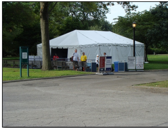
Figure 10: Temporary Storage (USTA)