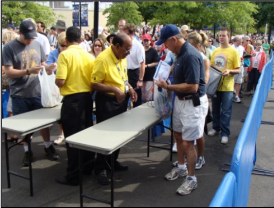
Figure 8: Entrance to Bag Search Location (USTA)