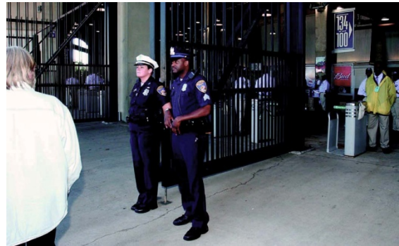
Figure 18: Law Enforcement Placement in Front of Ticket Collection (DHS)