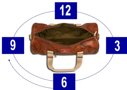
Figure 15: Move clockwise or counter clockwise throughout the bag