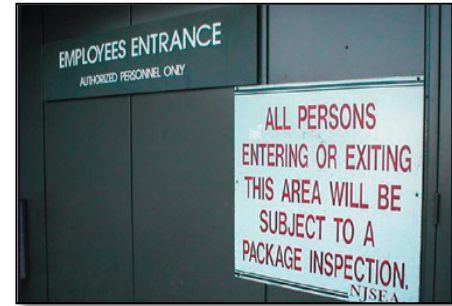
Figure 4: Nonevent Notice (NFL)