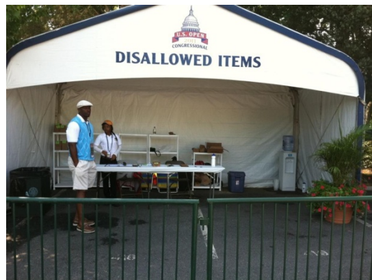
Figure 17: Disallowed Items Holding Area (USGA)