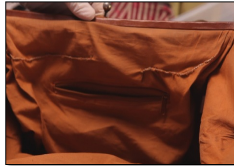
Figure 13: Evidence of Bag Tampering (DHS)