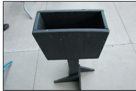
Figure 12: Template (NFL)