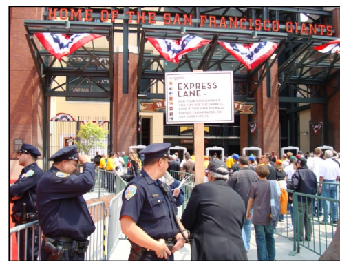
Figure 9: Non-Bag Search Lines (MLB)