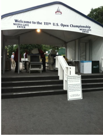
Figure 6: Media Search (USGA)