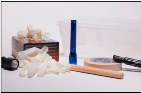
Figure 11: Bag Search Items for use by Venue Staff (DHS)

Tables used for bag searches should be located in front of the ticket collection area and other security checkpoints (e.g., personal searches).