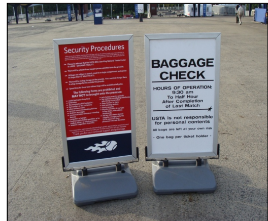
Figure 7: Signage (USTA)