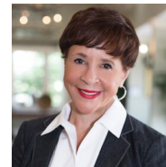
Sheila C. Johnson Founder & CEO, Salamander Hotels & Resorts