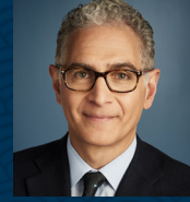
Immediate Past Chair Mark S. Hoplemazian President & CEO, Hyatt Hotels Corporation