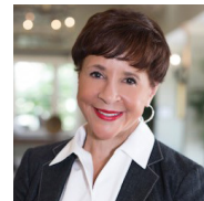
Sheila C. Johnson Founder & CEO, Salamander Hotels & Resorts