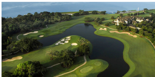
August 26-29, 2018 Sea Island Resort