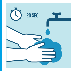
WASH HANDS WITH SOAP AND WATER OR SANITIZER AT LEAST 20 SEC